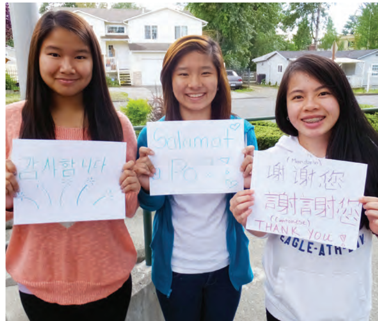
Teens from Foster Library thank you for your support.