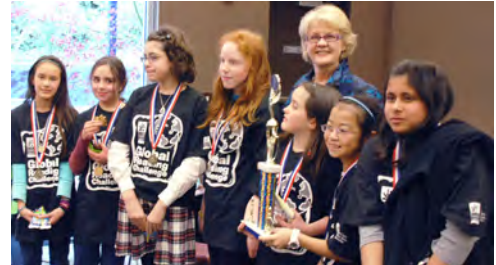
Winners: Deep Diving Dolphins, Audubon Elementary, Lake Washington School District.

Students seeking help with homework can visit Study Zones in nearly all libraries. Volunteers contributed more than 10,128 hours and tutored 6,796 students in Math, Science, Social Studies, English and Reading in 2010, a 14% increase over the previous year. KCLS offers the largest volunteer homework help program of any public library in the United States.